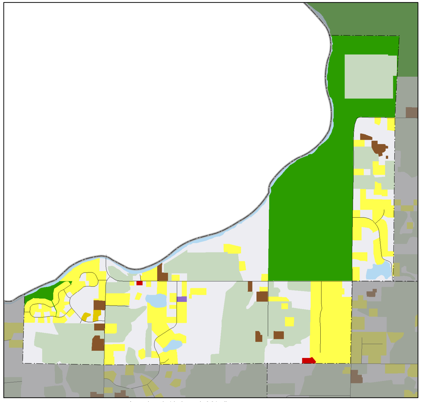
Approximately 1 inch equals 0.34 miles when printed on letter size paper